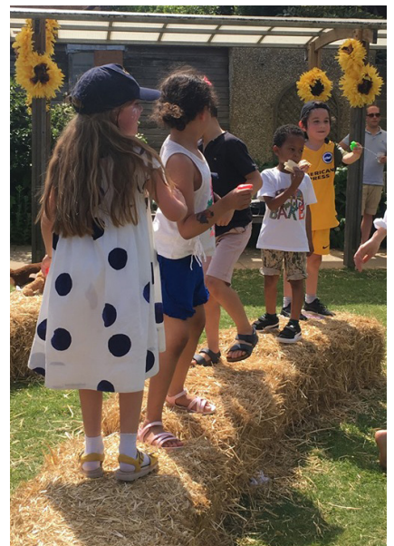
Summer Fayre 2019